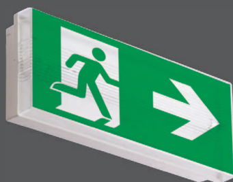
ANTARES AN-200 LED