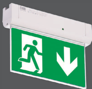
MIZAR S, SP LED MIZAR SIGN S, SP LED