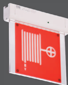
MIZAR SI LED MIZAR SIGN SI LED