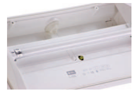
LED linear lamp