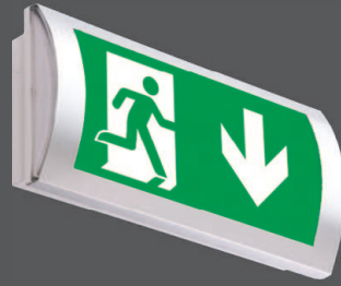
LYRA L-250 LED