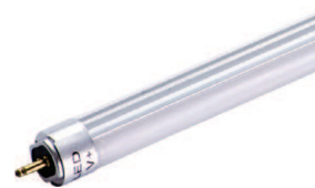
LED lamp radiator