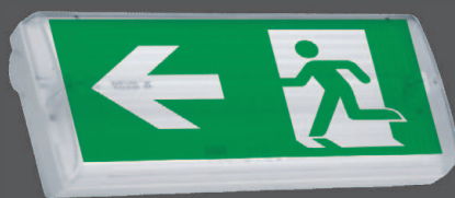
ORION EFS-350 LED