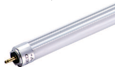
LED lamp radiator