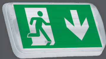
VEGA EFS-200 LED