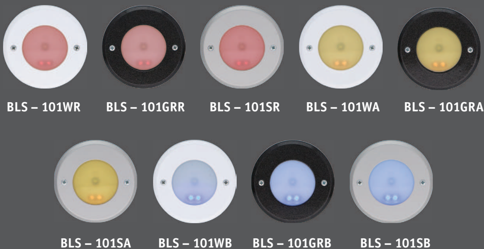
BLS – 101WR