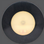
BS – 2GRA