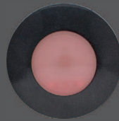
BS – 2GRR