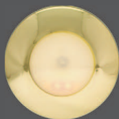
BS – 2GA