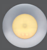
BS – 2TA