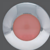
BS – 2NR