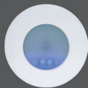
BS – 2WB