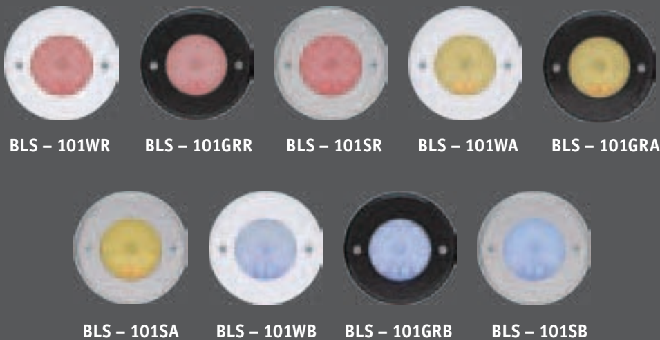
BLS – 101WR