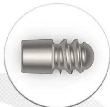
Smooth lateral surface reduces sinus tarsi