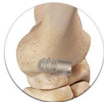
Tapered lateral edge ensures stability

Conservative treatment of flatfoot and PTTD.