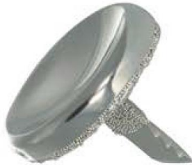
Porous Coated Implant