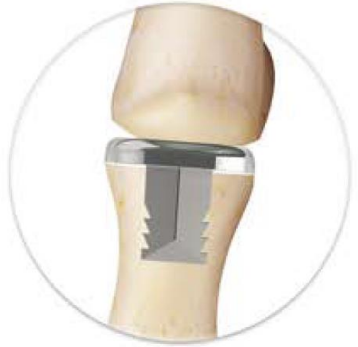
Minimum bone resection