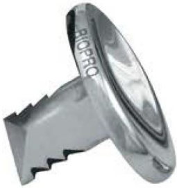
Non-Porous Coated Implant